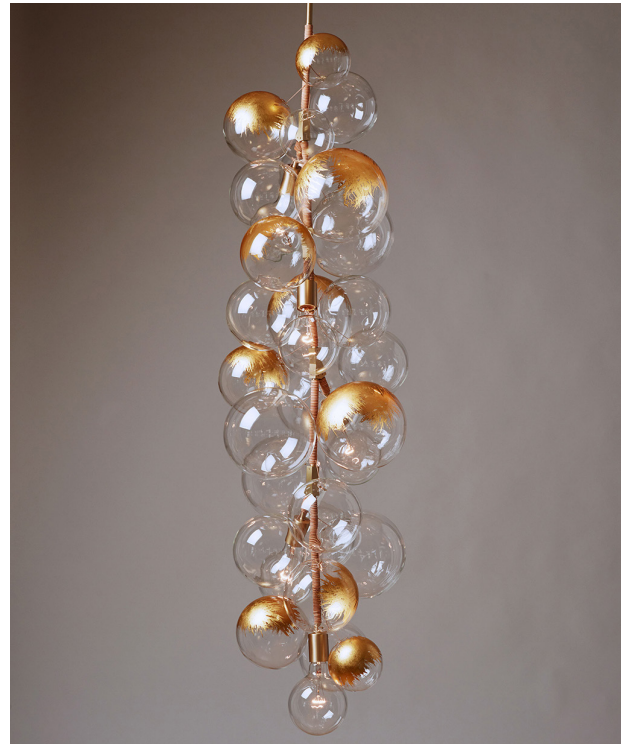
Pictured with Satin Brass Natural Leather Cord and mix of 24k Gilded and Clear Globes