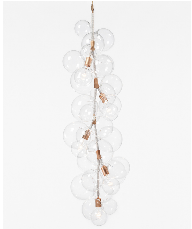
Pictured with Satin Brass and White Leather Cord