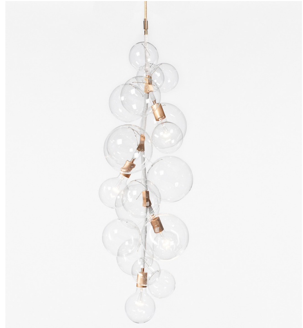
Pictured with Satin Brass and Natural Cotton Cord