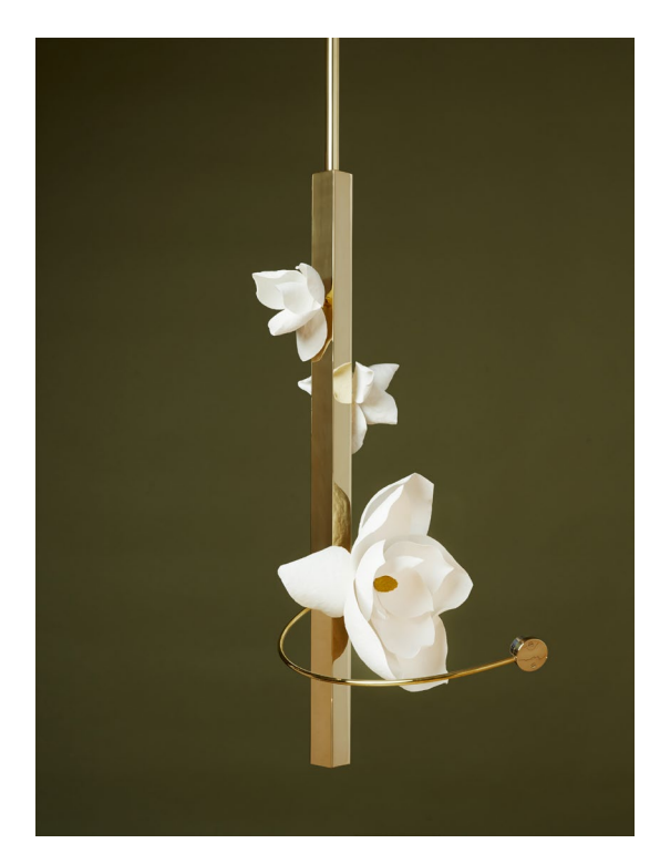
Pictured in Polished Brass with White Magnolia Flowers

The Lure Pendant is a single fixture that can be showcased on its own or collected into a group installation. The Lure lights use paper flowers that are sculpted by hand in our studio. Each blossom's petals are individually shaped and each lure blossom is unique. The sconce can be installed in various orientations. The slender LED arm can also be positioned at any angle.