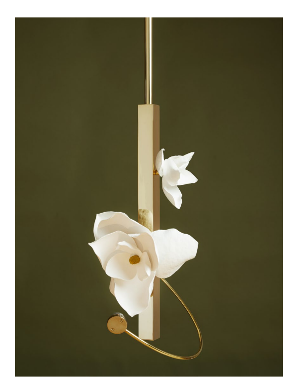
Pictured in Polished Brass with White Magnolia Flowers

is unique. The sconce can be installed in various orientations. The slender LED arm can also be positioned at any angle.