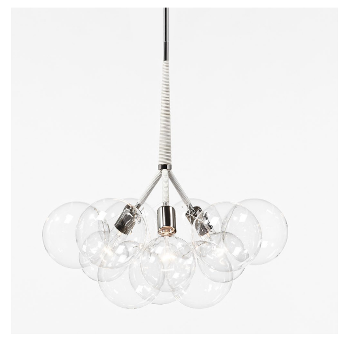
Large Bubble Chandelier pictured with Polished Nickel metal finish and White Leather coiling