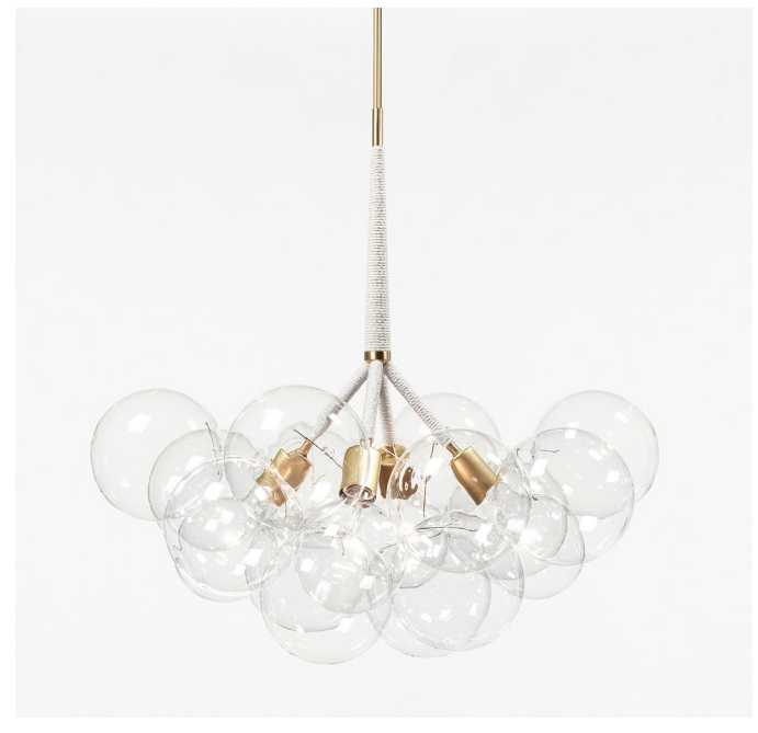
X-Large Bubble Chandelier pictured with Satin Brass metal finish and Natural Cotton coiling